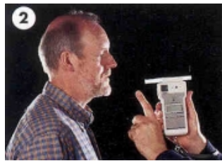
2 ATTACH MOUTHPIECE: INSTRUCT THE SUBJECT