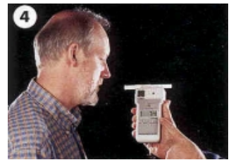
4 NOTE ALCOHOL READING