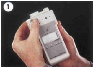
1 SWITCH ON: AUTOMATIC SELF CHECK